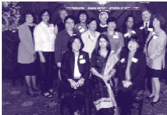
Caring for Children honorees.

Created in 2002 to support and represent the work of CACF through fundraising and outreach, the Action Council is a network of new volunteers who provide supportive work for CACF. Appealing to a wider audience and a new generation, the mission of these young professionals is to act as bridge builders in raising awareness of CACF's activities and goals. Key activities include raising funds, building a pan-Asian coalition, and sponsoring cultural events, diversity workshops, and outreach programs. The Action Council kicked off its inaugural year with a fundraising event at Barcode and raised over $2000.