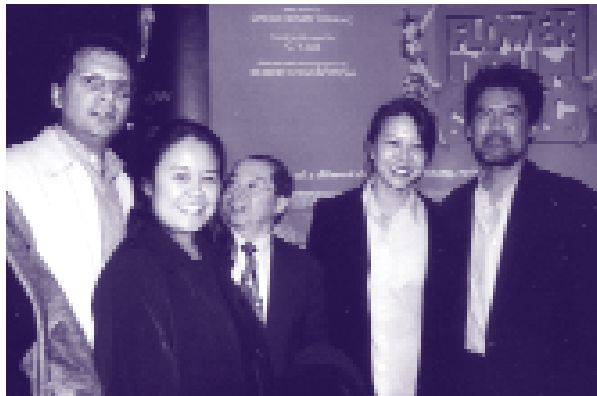
Board members and playwright David Henry Hwang at Flower Drum Song Community Preview.

Ong Family Foundation Pan Pacific and Southeast Asian Women’s Association Nonprofit Finance Fund WTC Business Recovery Grant Program