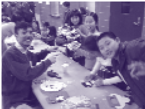
A Project CORE workshop at the Chinatown YMCA.

IMPACT! We can be the advocate for the community-based organizations who might not have time or resources to advocate on their own. Working together, CACF and community leaders can better express common concerns and build a common agenda to make sure that policy makers, educators, and social service providers do not forget our children.