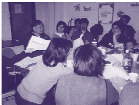
A meeting for Concerned Mothers.

"We often hear about or become involved in mentorship and other outreach programs, but we forget to recognize the organization that advocates for most of these programs. A mentorship can aid one child at a time, but an advocacy organization benefits the group as a whole."